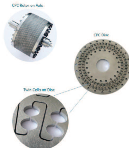
Figure 2. CPC column design

The actual CPC column or rotor is composed of a stacked series of stainless steel discs that rotates on an axis, providing the centrifugal force to hold the stationary phase on the column ( Figure 2 ). Each disc is engraved with hundreds of twin cells. These twin cells act similarly to the separatory funnel example, where the heavier mobile phase passes out one set of cells and is pumped into the next when operating in descending mode, repeating the separation hundreds of times. Molecules with greater affinity for the heavier mobile phase will move faster through the CPC column and elute earlier. This design provides better retention of the stationary phase, while allowing the use of higher flow rates for faster separations and increased productivity