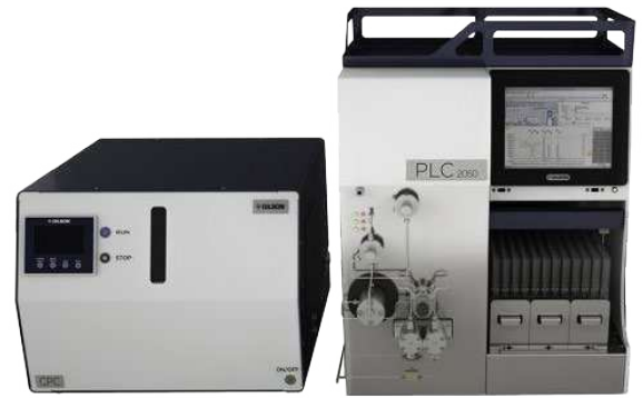
Figure 1 Gilson VERITY® CPC Lab System

Method: The elution flow rate was 12 mL/min, extrusion flow rate 50 mL/min, and rotation speed was 2000 rpm, with extrusion beginning after 35 minutes of elution. Detection was at 220 nm, 263 nm, 280nm and scan 200-400 nm.