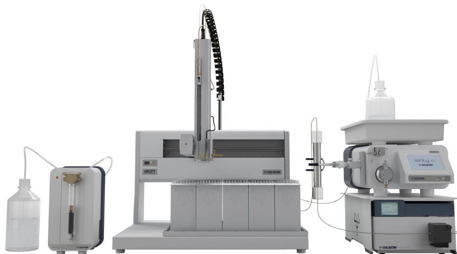
VERITY® HPLC Purification System with Isocratic Pump and UV/Vis Detector