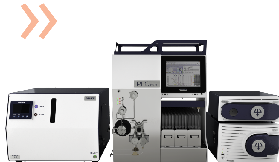
VERITY® PLC Purification System with Centrifugal Partition Chromatography (CPC) Column and MS Detector