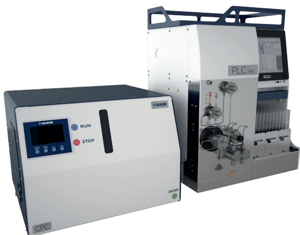
PLC Purification System (Right) shown with Centrifugal Partition Chromatography (CPC) Column (Left)