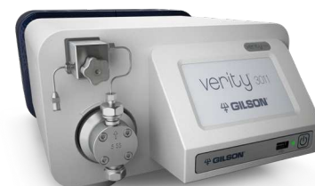
VERITY® 3011 Isocratic Pump