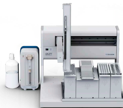
VERITY® 4020 Syringe Pump and GX-271 Liquid Handler