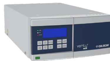
VERITY® 1741 UV-VIS Detector